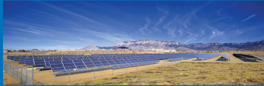
School Installation — 1.1 MW