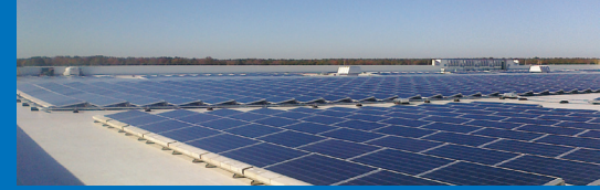
Commercial Installation — 372 KW